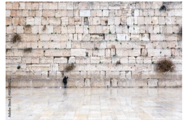
The Wailing Wall, Jerusalem, Israel