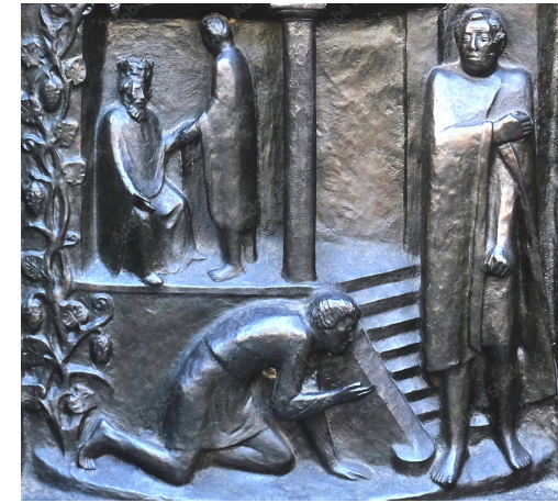
Parable of the unforgiving servant by zatletic © 2023 Adobe Stock