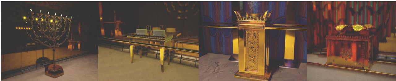
Illustration © 2023 Jeremy Park Bible-Scenes.com Creative Commons Attribution 4.0 International (CC BY 4.0) license.

The tabernacle, its construction, objects, priesthood, sacrifices, and its religious rites were physical models or shadows of the reality of the spiritual realm and the heavenly temple of God.