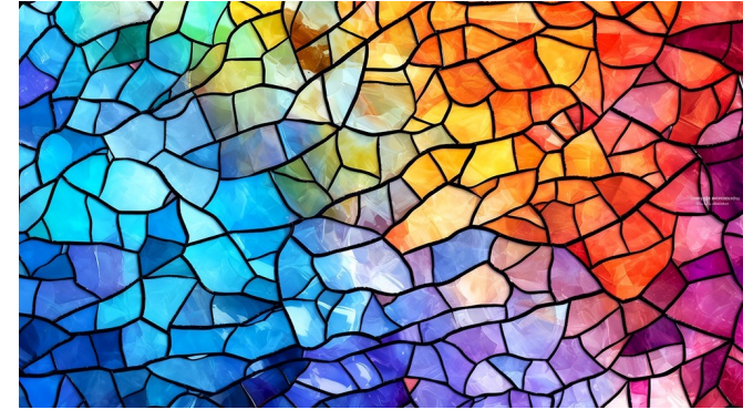
Illustration © 2024 - NK