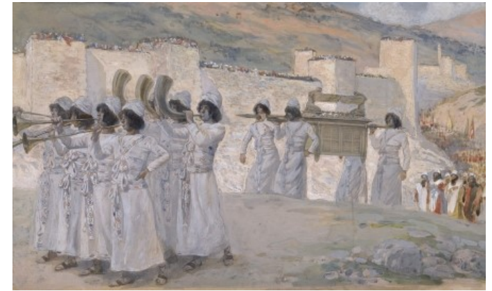
The Seven Trumpets of Jericho, James Tissot (1896-c. 1902) Public Domain