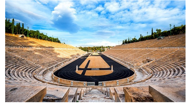
Panathenaic stadium in Athens, Greece.