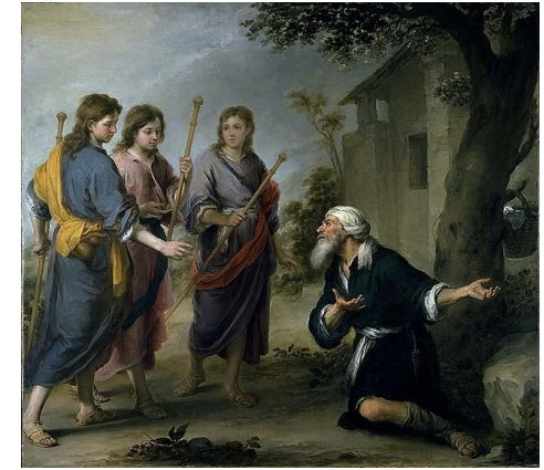
Abraham Receiving the Three Angels, Bartolome Esteban Murillo (1667)