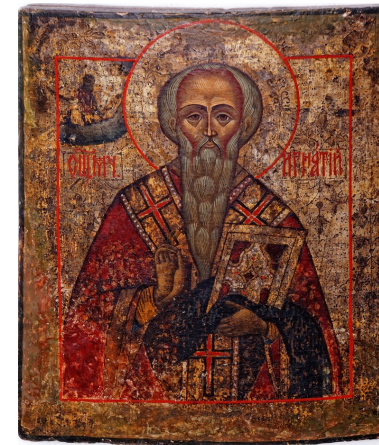
Ignatius Of Antioch (Icon)